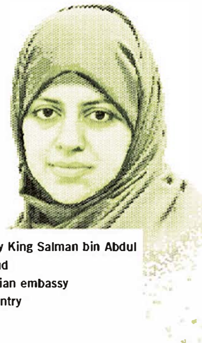
His Majesty King Salman bin Abdul Aziz Al Saud Saudi Arabian embassy in your country